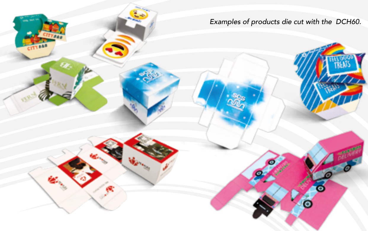
Examples of products die cut with the DCH60.